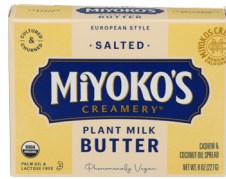
Miyoko's Organic Cultured Vegan Butter

Built on the foundation of craft and compassion, Miyoko's Creamery is the natural, compassionate evolution of dairy—using time-honored techniques and the finest ingredients to make our award-winning, phenomenally vegan, plant-milk butter and cheese.