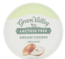
Green Valley Creamery Organic Lactose-Free Cream Cheese