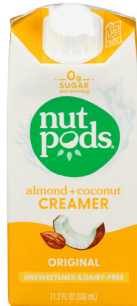
nutpods Dairy-Free Creamer (selected varieties)

Put some spring in your culinary creations with Organic Valley. High quality, delicious dairy that is ethically sourced from small organic family farms. This is dairy you can feel good about.