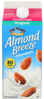
Almond Breeze Almondmilk