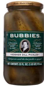
Bubbies Kosher Dill Pickles