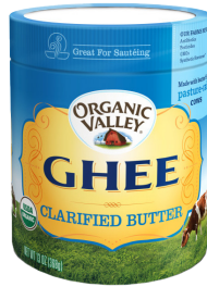
Organic Valley Organic Ghee