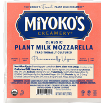
Miyoko's Organic Vegan Mozzarella