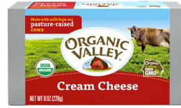
Organic Valley Organic Cream Cheese