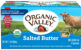
Organic Valley Organic Butter