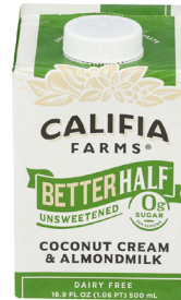
Califia Farms Better Half Creamer